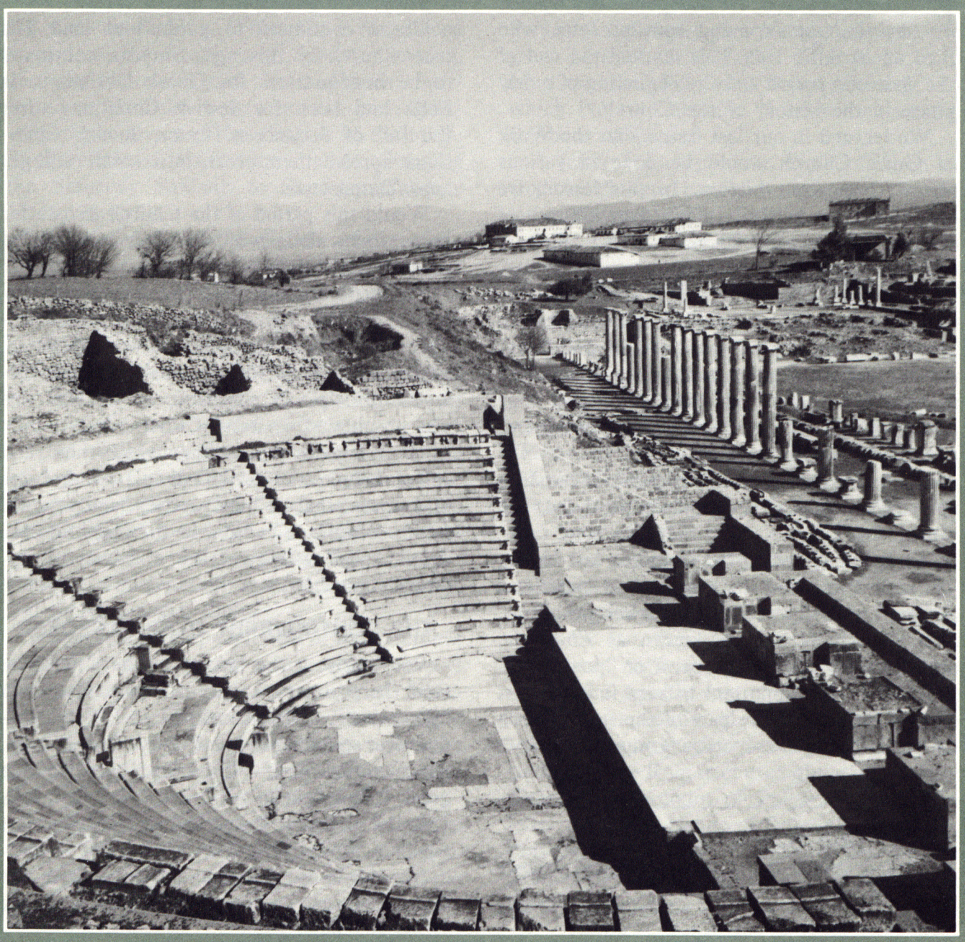
The History of God's Church-Part 2